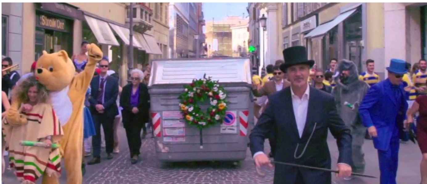
Funeral organised to the last road container.

Of course, any change in collection systems has some challenges and the procedures need some time to be optimised. In Parma the operators of the separate collection and an environmental brigade make sure the collections are performed properly. Soon after the introduction of the new system, the problems that arose with the change –such the type of bag to be used and the time of collection- have been significantly reduced. Yet there is still some control from the company and the operators who, at the same time, provide feedback to citizens.