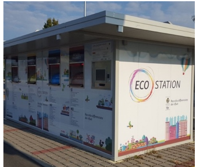
An Eco-station.

At the beginning of early 2016, there were four eco-stations located on the outskirts of Parma, and four more are to be installed by the end of 2016.